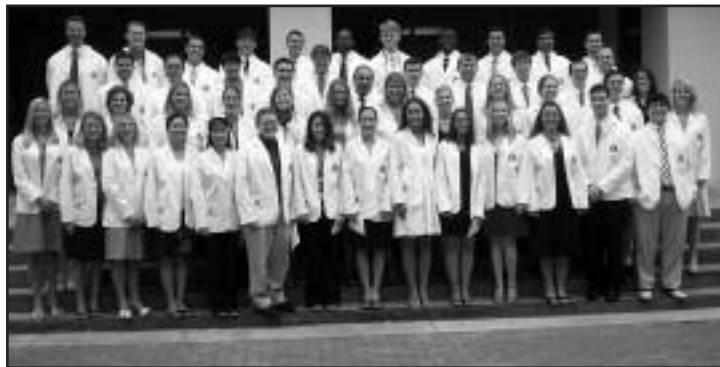
The South Carolina Dental Association presented the rising Junior Class of dental students with their clinicallab jackets. As the students transition into caring for patients, their professional appearance is enhanced by the monogrammed white coat. The SCDA Board feels it is appropriate to support the ASDA chapter of future dentists.