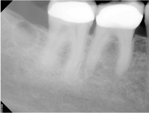
Figure 1. Well-circumscribed, mandibular radiolucency distal to #31.

A 62-year old female presented with this well-circumscribed radiolucency distal to #31 (Figure 1). The lesion measured 0.6 x 0.6 cm and was asymptomatic. The patient reported that all of her third molars had been extracted many years ago. Upon intraoral examination, the mucosa overlying the lesion appeared purplish blue with a normal surface texture. No swelling or bony expansion was evident. Upon surgical exploration, black, tarlike material was observed. The tissue was submitted for histopathologic examination, and a photomicrograph is shown here (Figure 2).