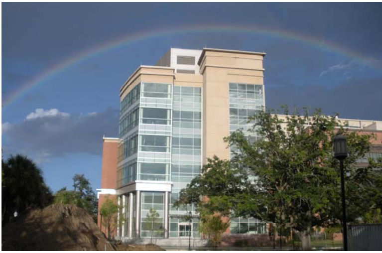
Rainbow over the new James B. Edwards College of Dental Medicine at MUSC.