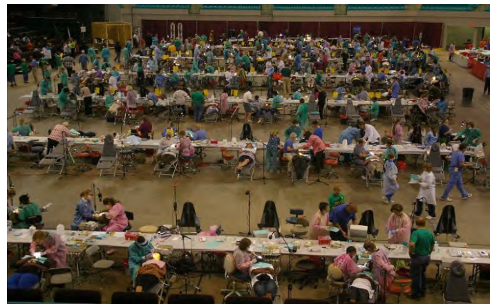
Patients receiving care in Florence last year