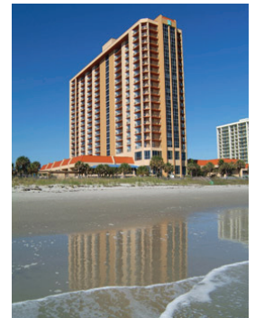
Embassy Suites - Kingston Plantation

As one can see, the 2011 SCDA Annual Session will feature some of the most outstanding continuing education programs and social events possible. All that is needed is YOU to register to attend. Simply put, the 2011 convention will be hard to beat. We hope to see you there April 28 to May 1, 2011.