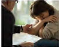
Practice Protection Plan