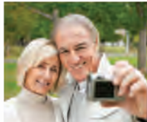
Practice Appraisals & Sales