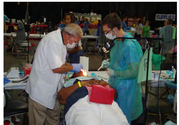
2012 DAD Project- Columbia, SC

So, if you plan to be a part of the largest "mash" unit of dentistry in the state and you haven't registered yet, click here to get the form. Any particular questions regarding this event should be directed to the SCDA at 803-750-2277. If you can't help or want to volunteer closer to home, there are other opportunities for you to share your skills on the SCDA website which can be found by clicking Community (on the home page), and then click Dental Clinics.